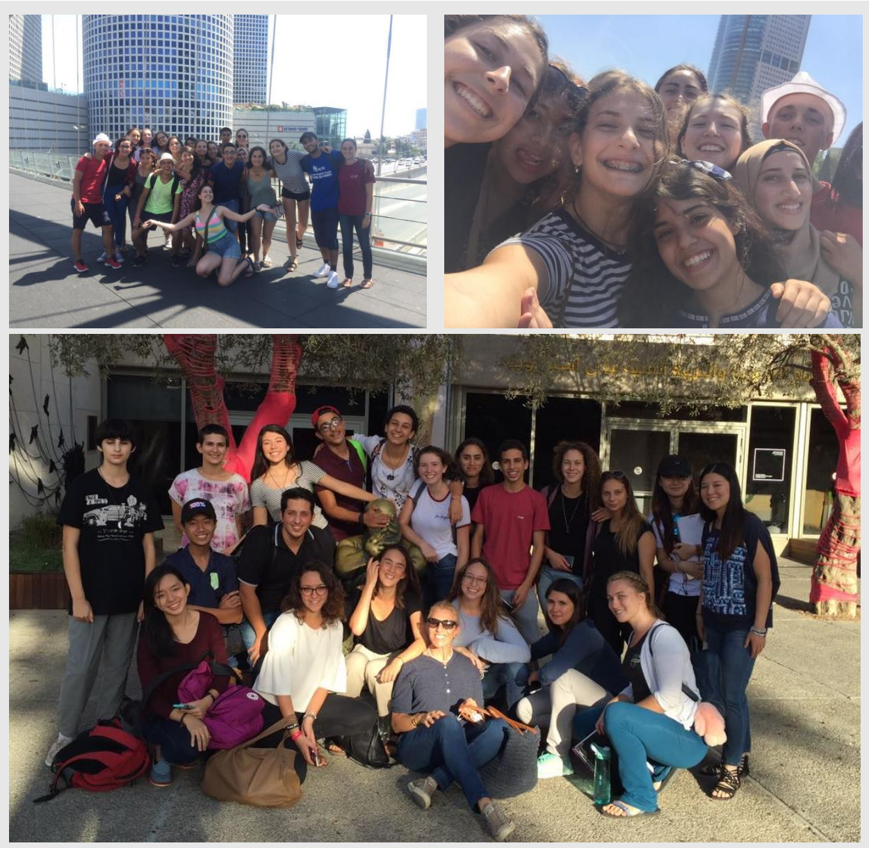
Click here to watch all photos >>>